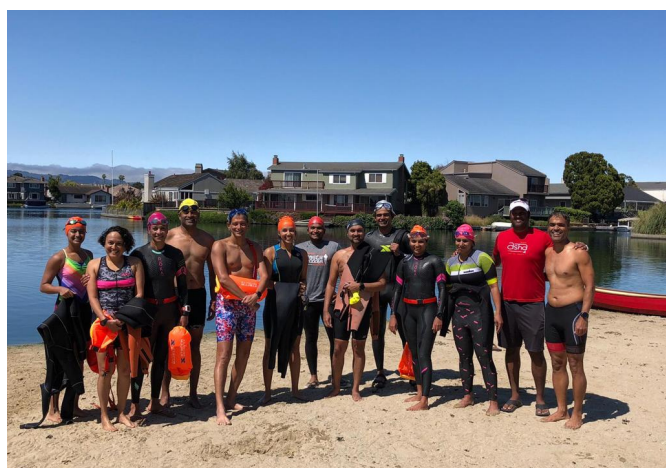
TA triathlon team after an open water swim session

Hence, we have put together our own Ironman distance 140.6 event slated for the same day, with appropriate social distancing. We will follow all the rules of an official Ironman as close as possible, including medals and t-shirts, and attempt to give them as close to an Ironman experience as possible. So come October 17th, our athletes will race, and for once this year, we may have outdone the pandemic!