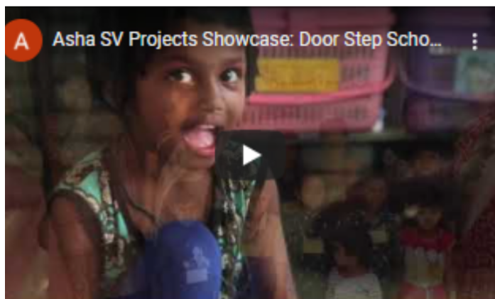
Video about Asha SV's partnership with Door Step Schools

Doorstep School [DSS] provides education and support to the often-forgotten children of pavement dwellers, slum dwellers, construction site families, and many other underprivileged families in Pune and Mumbai regions of Maharashtra. Many of these children are not enrolled in school and have limited access to books and a place to study. Additionally, many children drop out of school to work or care for younger siblings. With neither support nor resources at home some children also suffer from very low learning levels. DSS is trying to bridge this gap by bringing education to the "Doorstep" of these children.