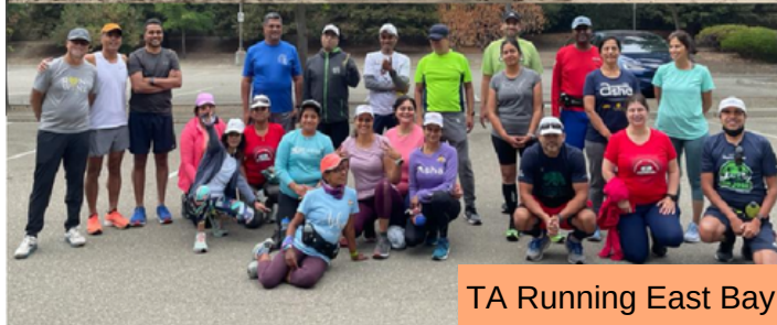
TA Running East Bay