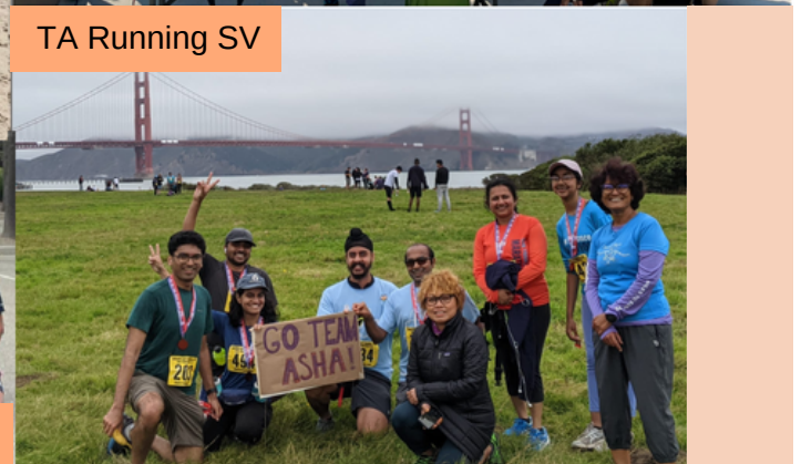
TA Running SV