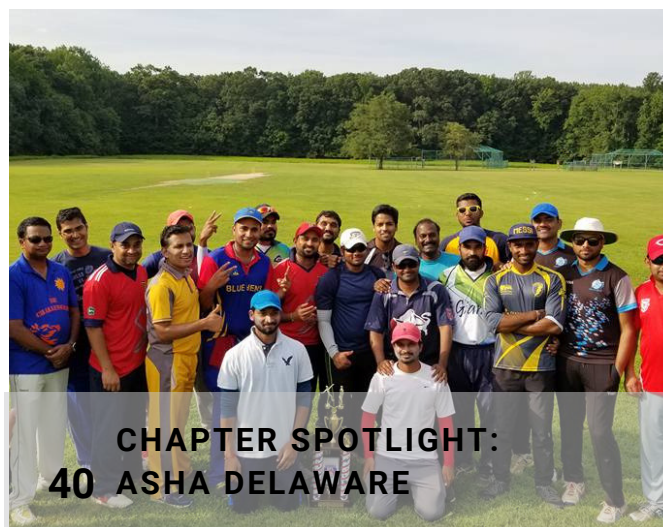
CHAPTER SPOTLIGHT: 40 ASHA DELAWARE

CHAPTER CASE STUDY 44 Distributed Models and Towards Sustainability - Asha Austin