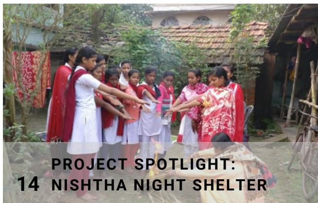
PROJECT SPOTLIGHT: 14 NISHTHA NIGHT SHELTER